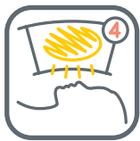
GLASS FACIAL SYSTEM